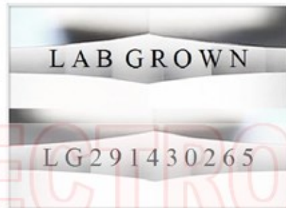
Girdle laser inscribed "LAB GROWN" and "LG291430265"

*Comments: This man-made diamond was grown in a laboratory by the CVD method, and has the same chemical, physical, and optical properties as a natural earth mined diamond. This lab grown diamond is classified as Type IIa, which is the most chemically pure type of diamond, and almost or entirely devoid of impurities. Only 1-2% of natural earth mined diamonds are Type IIa, whereas, colorless and near-colorless CVD lab grown diamonds are usually Type IIa.