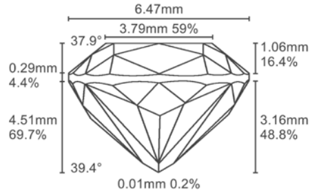
Actual proportion diagram