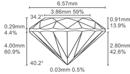
Actual proportion diagram