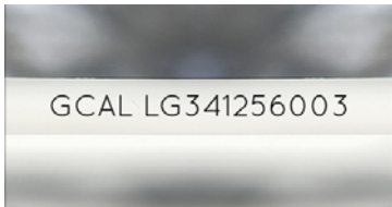
Illustration depicts approx. girdle appearance