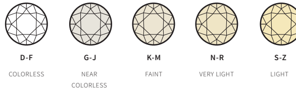
For illustration purposes only