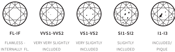
For illustration purposes only