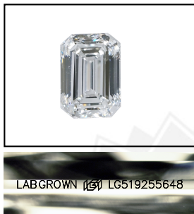
LASERSCRIBE SM Sample Images Used

Comments: As Grown - No indication of post-growth treatment. This Laboratory Grown Diamond was created by High Pressure High Temperature (HPHT) growth process. Type II