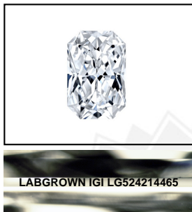
LASERSCRIBE SM Sample Images Used

Comments: This Laboratory Grown Diamond was created by Chemical Vapor Deposition (CVD) growth process and may include post-growth treatment. Type IIa