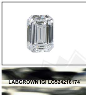
LASERSCRIBE SM Sample Images Used

Comments: This Laboratory Grown Diamond was created by Chemical Vapor Deposition (CVD) growth process and may include post-growth treatment. Type IIa