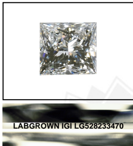
LASERSCRIBE SM Sample Images Used

Comments: This Laboratory Grown Diamond was created by Chemical Vapor Deposition (CVD) growth process and may include post-growth treatment. Type IIa