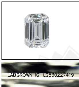
LASERSCRIBE SM Sample Images Used

Comments: This Laboratory Grown Diamond was created by Chemical Vapor Deposition (CVD) growth process and may include post-growth treatment. Type IIa