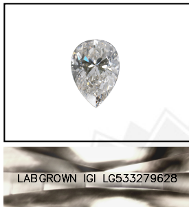
LASERSCRIBE SM Sample Images Used

Comments: As Grown - No indication of post-growth treatment. This Laboratory Grown Diamond was created by High Pressure High Temperature (HPHT) growth process. Type II