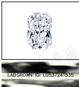
LASERSCRIBE SM Sample Images Used

Comments: This Laboratory Grown Diamond was created by Chemical Vapor Deposition (CVD) growth process and may include post-growth treatment. Type IIa