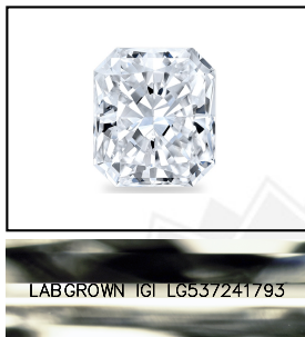
LASERSCRIBE SM Sample Images Used

July 20, 2022 IGI Report Number LG537241793 Description LABORATORY GROWN DIAMOND Shape and Cutting Style RADIANT CUT Measurements 5.86 X 4.34 X 3.08 MM