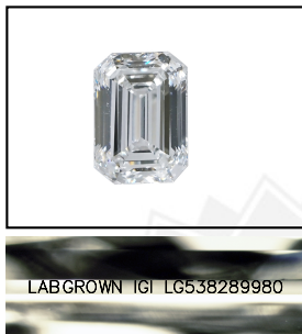
LASERSCRIBE SM Sample Images Used

Comments: This Laboratory Grown Diamond was created by Chemical Vapor Deposition (CVD) growth process and may include post-growth treatment. Type IIa