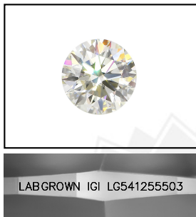
LASERSCRIBE SM Sample Images Used

Comments: As Grown - No indication of post-growth treatment. This Laboratory Grown Diamond was created by High Pressure High Temperature (HPHT) growth process. Type II Faint Blue