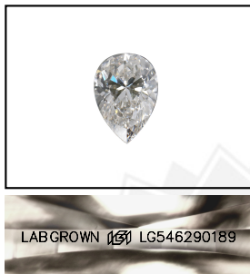
LASERSCRIBE SM Sample Images Used