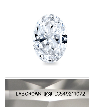
LASERSCRIBE SM Sample Image Used

October 18, 2022 IGI Report Number LG549211072 Description LABORATORY GROWN DIAMOND Shape and Cutting Style OVAL BRILLIANT Measurements 13.79 X 9.75 X 6.16 MM GRADING RESULTS Carat Weight 5.13 CARATS Color Grade H Clarity Grade VS 1 Cut Grade VERY GOOD