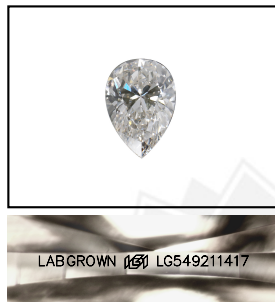
LASERSCRIBE SM Sample Images Used

Comments: As Grown - No indication of post-growth treatment. This Laboratory Grown Diamond was created by High Pressure High Temperature (HPHT) growth process. Type II