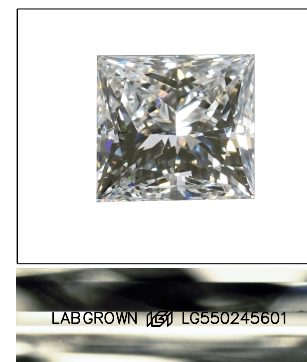
LASERSCRIBE SM Sample Image Used

Red symbols indicate internal characteristics. Green symbols indicate external characteristics.