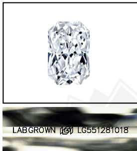
LASERSCRIBE SM Sample Images Used

Comments: This Laboratory Grown Diamond was created by Chemical Vapor Deposition (CVD) growth process and may include post-growth treatment. Type IIa