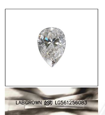
LASERSCRIBE<sup>SM</sup> Sample Image Used