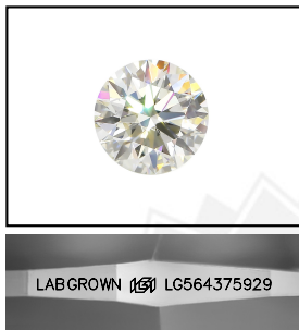
LASERSCRIBE SM Sample Images Used

Comments: As Grown - No indication of post-growth treatment. This Laboratory Grown Diamond was created by High Pressure High Temperature (HPHT) growth process. Type II