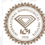
HEARTS & ARROWS