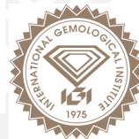
HEARTS & ARROWS