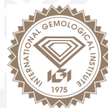
HEARTS & ARROWS