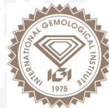
HEARTS & ARROWS