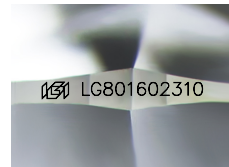
Sample Image Used

Comments: This Laboratory Grown Diamond was created by Chemical Vapor Deposition (CVD) growth process. Type IIa